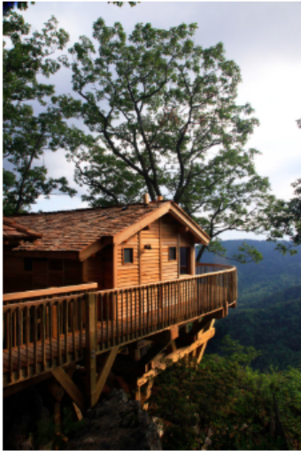
A treehouse at Primland.

Despite the name, you can be saucy at this property in Meadows of Dan. Eschew the mansion on the grounds (although you'll want to stargaze in its observatory) and stay in a private lodge, cabin or one of three treehouses for the experience Primland calls "ritzy but rugged." The treehouse named Golden Eagle was built by a French company and involves nary a nail driven into the host oak. Activities abound: 18-hole golfing on a course that made Golf magazine's list of the " top 100 courses anyone can play ," guided tree climbing (no joke), biking, watersports, geocaching, horseback riding and a multitude of other things, including tomahawk throwing. Sport shooting is a specialty of the property: Guests can don tweed hats and waistcoats and get their "Downton Abbey" on at the European Style Released Pheasant Shoot. Or, in season, they can wear orange for a day of modern hunting. Those who prefer not to aim at live creatures can visit the 14-station clay-shooting course.